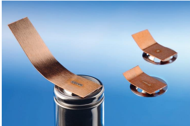
Image 1: As part of the AiF project MikroPuls, Fraunhofer ILT is developing laser processes for the efficient contacting of battery cells (pictured: laser-welded copper connectors on cylindrical cells).